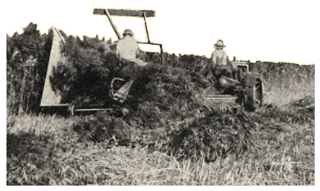
Harvesting luxurious fields of hemp in Texas with a grain binder

One obstacle in the onward march of hemp is the reluctance of farmers to try new crops. The problem is complicated by the need for proper equipment a reasonable distance from the farm. The machine cannot be operated profitably unless there is enough acreage within driving range and farmers cannot find a profitable market unless there is machinery to handle the crop.