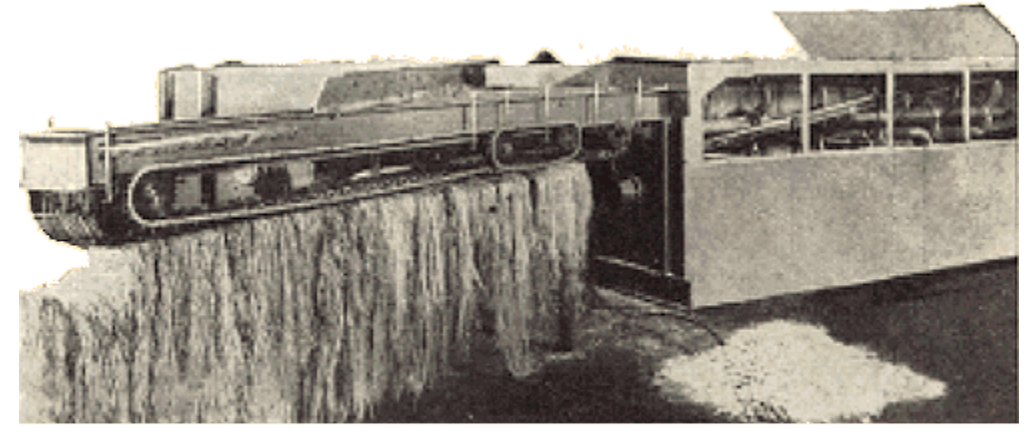
Hemp fiber being delivered from machine, ready for baling. Pile of pulverized hurds beside machine is 77 percent cellulose..

From the farmer's point of view, hemp is an easy crop to grow and will yield from three to six tons per acre on any land that will grow corn, wheat, or oats. It can be grown in any state of the Union. It has a short growing season, so that it can be planted after other crops are in. The long roots penetrate and break the soil to leave it in perfect condition for next year's crop. The dense shock of leaves, eight to twelve feet above the ground, chokes out weeds. Two successive crops are enough to reclaim land that has been abandoned because of Canadian thistles or quack grass.