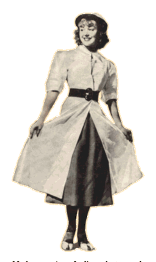
Modern version of a linen duster made from hemp, one of the toughest fibers in the world.

From this point on, almost anything can happen. The raw fiber can be used to produce strong twine or rope, woven into burlap, used for carpet warp or linoleum backing, or it may be bleached and refined, with resinous by-products of high commercial value. It can, in fact, be used to replace foreign fibers which now flood our markets.